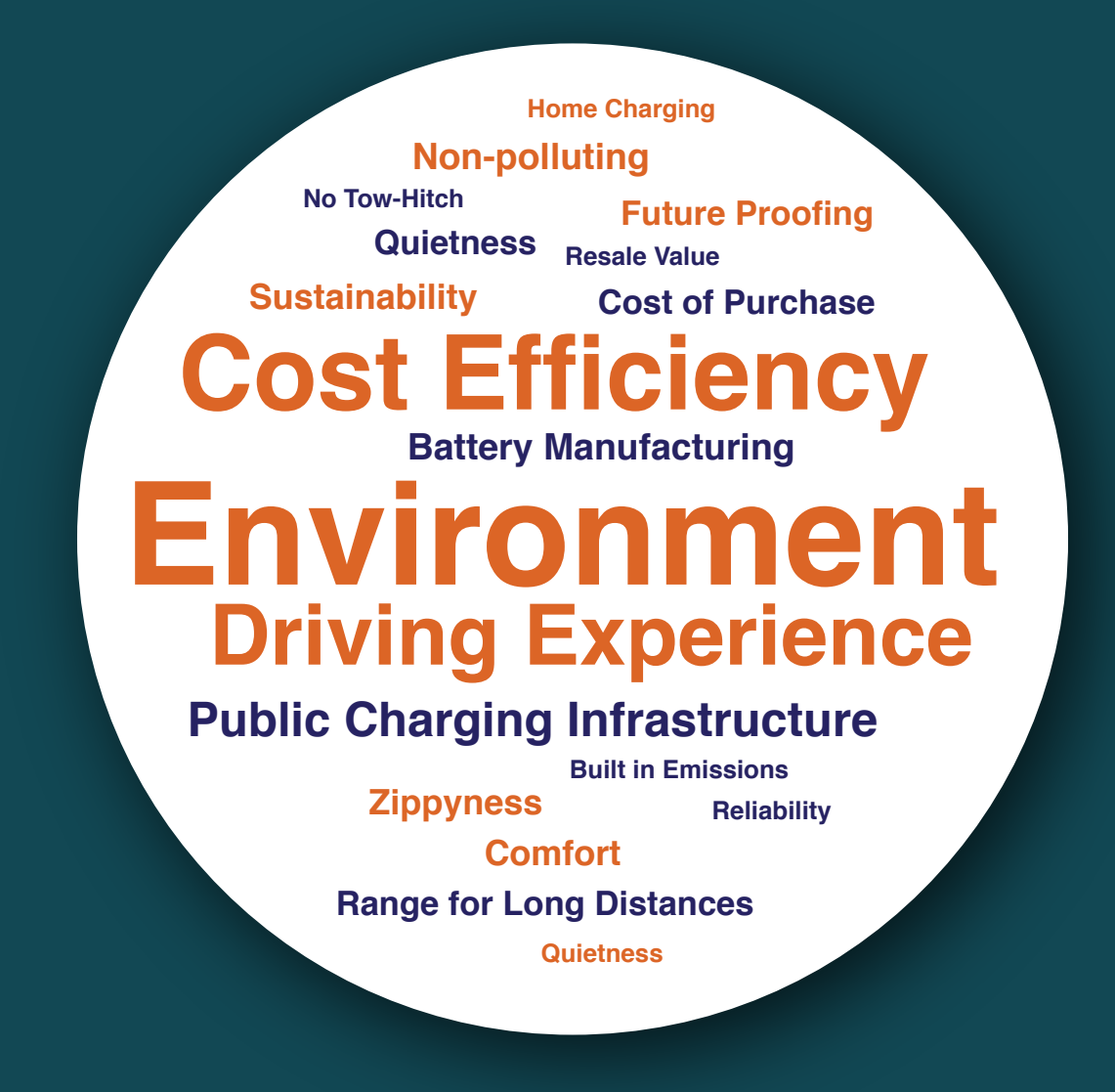
Fig. 2 Mind map of positives and negatives of Electric Vehicles from trial participants. Orange is used for positives and navy for negatives.

The participants within the trial were asked to outline three positive and three negative things which come to mind when thinking about electric vehicles. This was done both at the beginning and end of the trial. A mind map has been developed to illustrate participant responses.