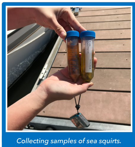
Collecting samples of sea squirts.